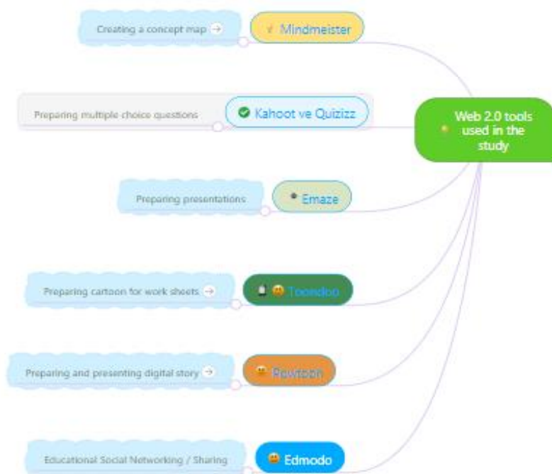
Figure 2. Web 2.0 Tools Used by Pre-service Teachers and Intended Use

During the remaining six weeks of the course, content was developed by pre-service teachers using Web 2.0 tools according to the topics determined by the researcher. Five questions related to traditional assessment techniques were prepared by Kahoot and five questions related to complementary assessment techniques were prepared by Quizizz. Powtoon to prepare animations for addressing possible validity and reliability misconceptions, Emaze to prepare presentations for subject repetition, Mindmeister for mapping the concepts of measurement and evaluation course, Tondoo to create cartoon for work sheet for test and item analysis content. The flow chart that reflects the said process is presented in Figure 2.