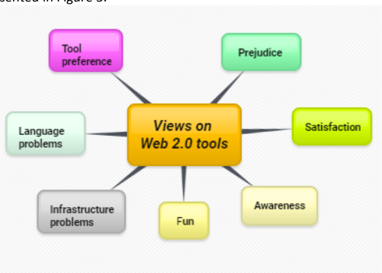
Figure 3. The Themes Determined by the Participant Views on Content Development Using Web 2.0 Tools

The present section is on the study findings related to the analysis of the data collected with the semi-structured interview form that included six questions and completed by the participants. Pre-service teachers were asked questions on the functions of the utilized tools, the facilities provided by these tools, their limitations, and the difficulties and opportunities they experienced during the content development process. Their views were grouped under seven themes. These themes are presented in Figure 3.